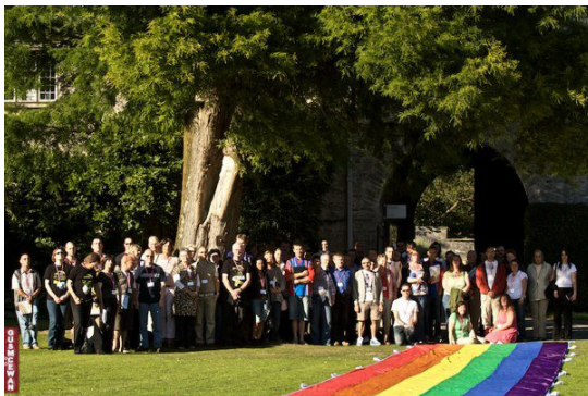
Everyone gathered in the Courtyard at Dartington Hall

Just so you can plan ahead, get your diaries out and stick Sat 11th and Sunday 12th September in for Let's Get Back Together 2010. Venue is yet to be confirmed!!