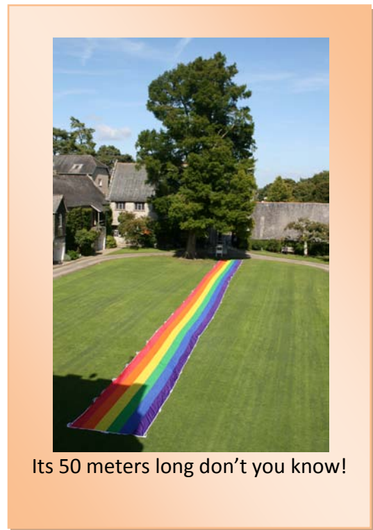
Its 50 meters long don't you know!