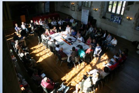
The LGBT Collective meeting at the LGBT09 conference

Showing off the new Pride flag own by Exeter & Plymouth Prides & the Intercom Trust at Dartington