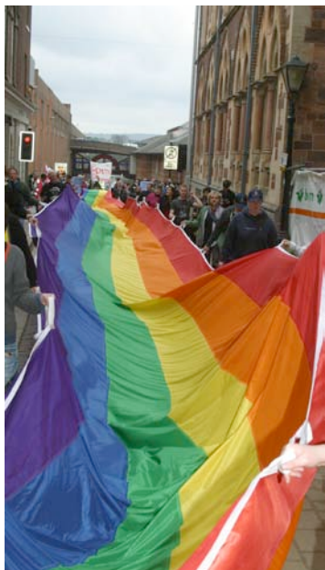
The front of the Exeter Pride Parade

Exeter Pride sets off the Pride season! A huge thank you goes out to all the organizers, supports, volunteers, and everyone that turned up, making Exeter Pride 2010 such a huge success.